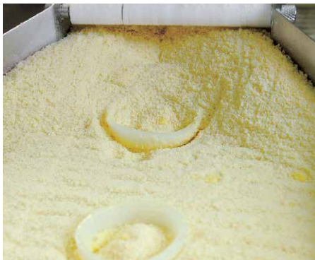
Consistency – Battered items are completely and evenly coated.

What’s more, the Bettcher ACS delivers high-capacity breading production in a small equipment footprint of only 17” x 22”.