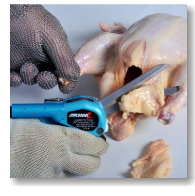
Trimming Fat Pad