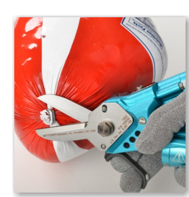
Clip Removal / Cutting Netting