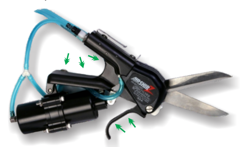
Comfort fit design.