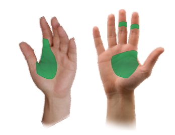
With AirShirz, increased surface contact spreads force over a larger area for improved operator comfort.