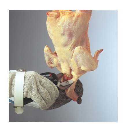
Magnum delivers extra cutting power for tough applications like neck breaking.