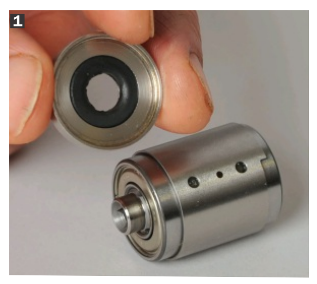
Inspect the seal plate for nicks, dents or wear. Inspect the O-Ring seal for cracks or cuts. Replace if damaged.