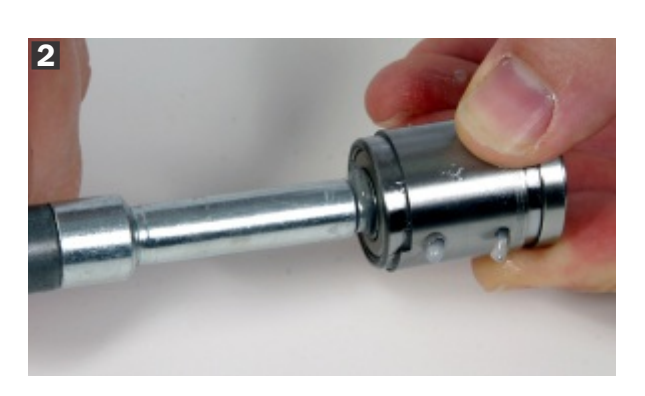
Re-grease gear head using Max-Z-Lube grease every 80 hours. The new grease will push out the old, dirty grease. Part #184282