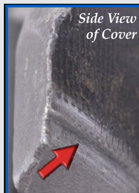
Side View of Cover

Side View: This close-up shows how much cover material has been worn away and can no longer affix to the frame.