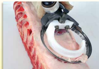
Bone-in Loins Trim the fat, not the lean