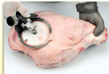
Ham Defatting Precise and efficient