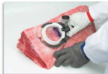
T-Bone Defatting Improved appearance and productivity