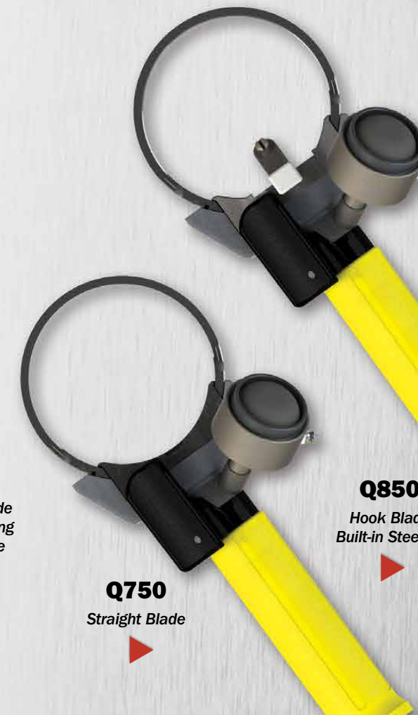
Q850 Hook Blade Built-in Steeling