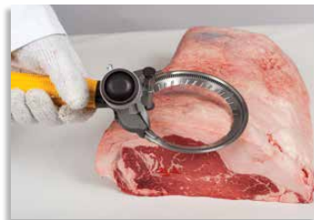
Beef Strips Improved yield and appearance