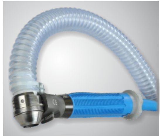
Light weight, electric TrimVac is simple to use and easy to master.