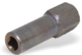
Quantum Drive Shaft Tool Part #101252