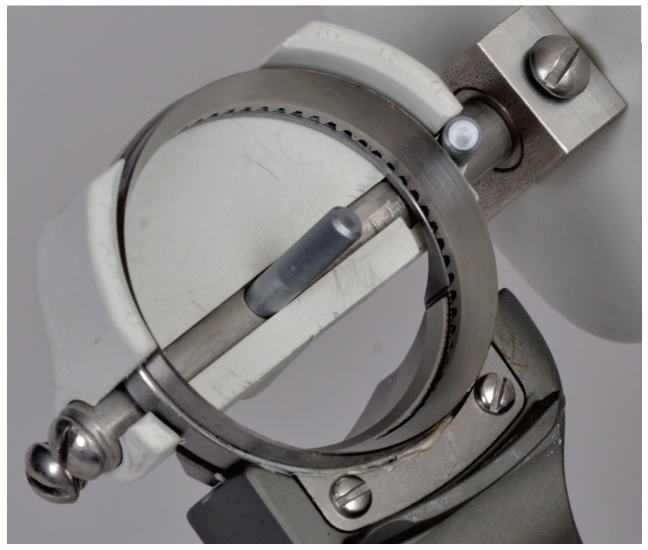
Trimmer locator precisely guides the trimmer against the inside and outside blade steeling rods for fool-proof edge restoration.