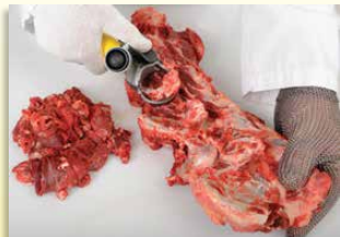
Beef Neck Bone Trimming Maximize high-value yields