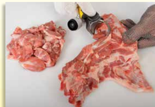
Pork Neck Bone Trimming Higher yields ... higher profits