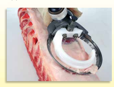
Bone-in Loins Trim the fat, not the lean