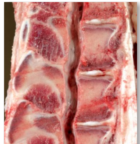
TrimVac delivers a clean spinal canal.