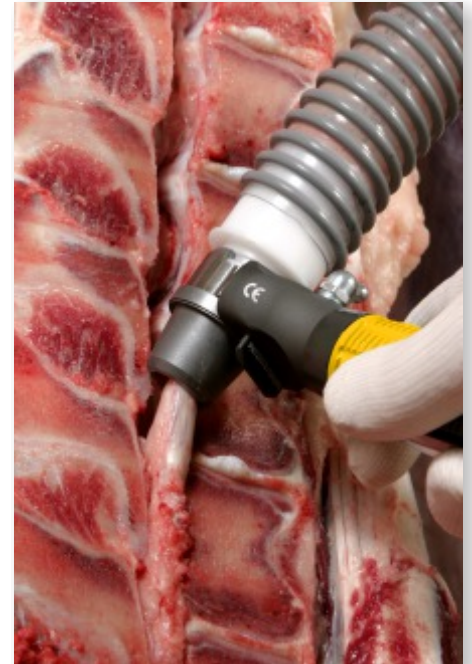
The TrimVac cuts and vacuums away debris in the spinal canal.

The TrimVac is used to dislodge, cut and vacuum away the spinal cord and sheath. Pneumatically powered, the TrimVac uses a rotating blade to provide the cutting action, while a highly effective vacuum system removes the tissue. Material is conveyed so spinal cords do not come into contact with the carcass, workers or floor, the work area has less opportunity for contamination and the process is simplified.